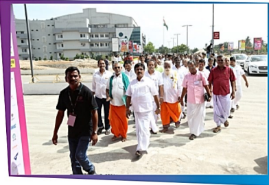
Paramakudi Weavers Visit