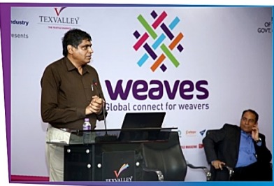
Seminars & Conference