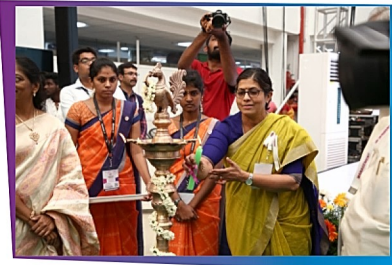
Lighting of Kuthuvilaku