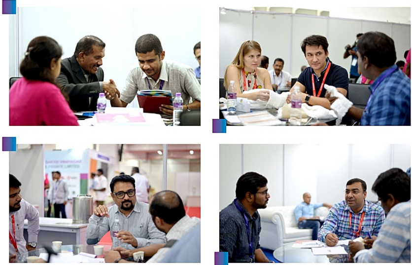
Business Meetings in B2B Lounge

The B2B Meeting- An unique platform was arranged where the exhibitors and buyers could connect with each other on a pre-fixed meetings at the show. The platform was utilized extensively and 550+ meetings were held.