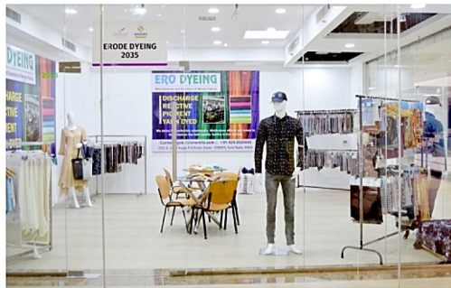
Double Stall View