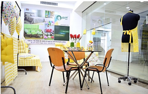
Single Stall View