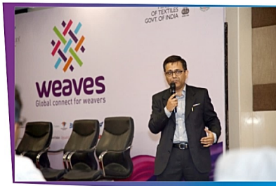
Seminars & Conference

WEAVES- A four day flagship event was successfully conducted at Texvalley, Erode, Tamilnadu, India between 5 & 8 Dec 2018. This event attained a grand success with the collective efforts of exhibitors, buyers, visitors, chief & special guests, eminent speakers, supporting organizations and media partners.