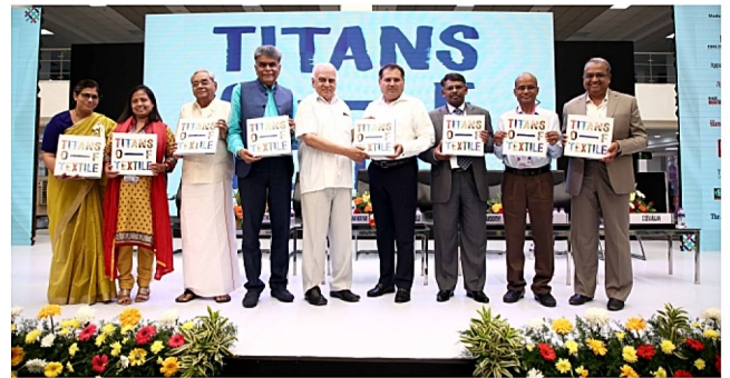
TITANS OF TEXTILES - Coffee Table Book released on inaugural session

To connect the textile expertise with global / national investors and buyers to explore opportunities and exhibit the strength of our textile cluster.